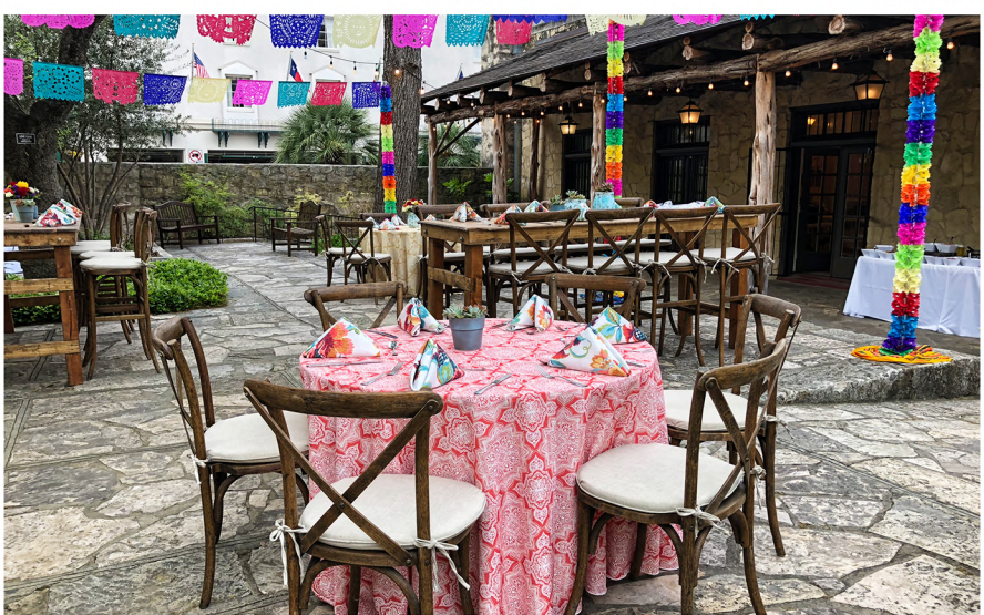
Alamo Hall Patio