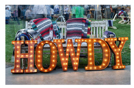
Alamo Hall Patio