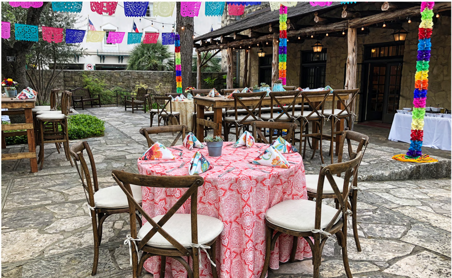
Alamo Hall Patio