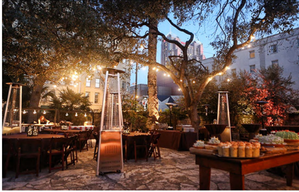
Alamo Hall Patio